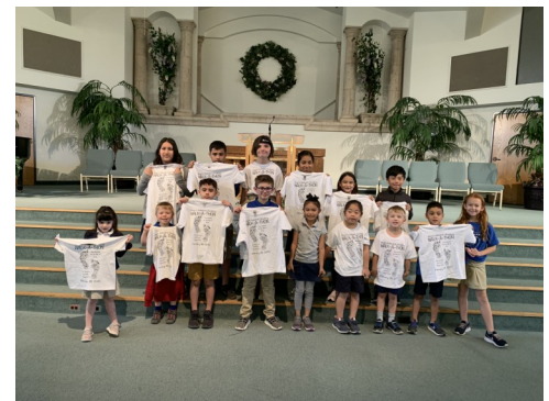
students received their Walk-a-Thon T-Shirt

The winners of our Walk-a-thon, those who walked the most laps and raised the most money, will be printed in next week's newsletter.