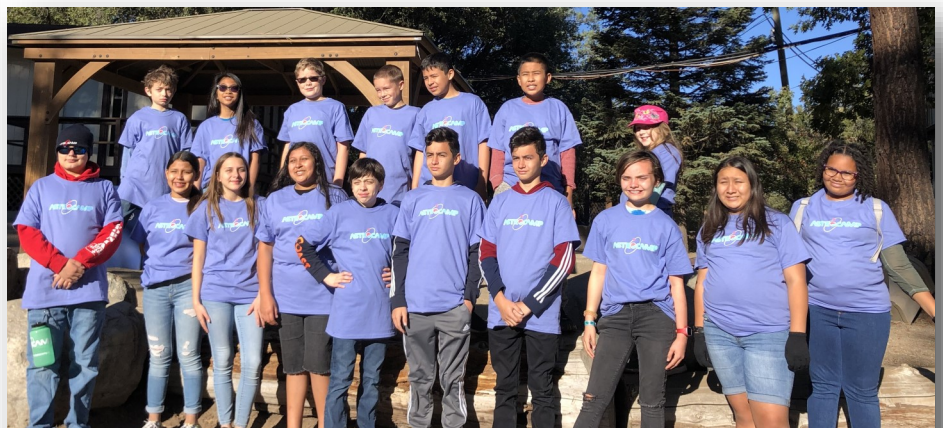
Students in grades 5th-8th attend Science Camp in Idyllwild.