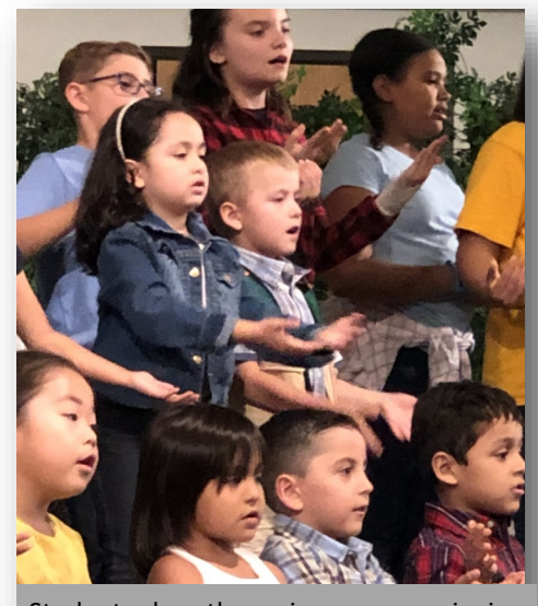
Students close the spring program singing about God's awesome power.

he students did an amazing job last night! We are so proud of them and all their hard work. We hope you enjoyed your night camping with God's creations, watching the stars so bright, & being reminded of God's great power. Thank you to the teachers for organizing the evening's performances, working with the students, & making it a memorable evening. Thank you also to our families who were able to provided refreshments.